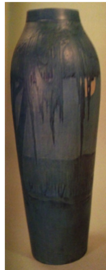
Figure 8 Vase with Sadie Irvine's Popular Moon Motif

Irvine is well known for creating the pots decorated with a moon shining through moss hanging from a live oak tree, a motif that has become synonymous with Newcomb arts. In later years, she rued creating this most famous design: "I have surely lived to regret it. Our beautiful moss draped oak trees appealed to the buying public but nothing is less suited to the tall graceful vases—no way to convey the true character of the tree. And oh, how boring it was to use the same motif over and over though