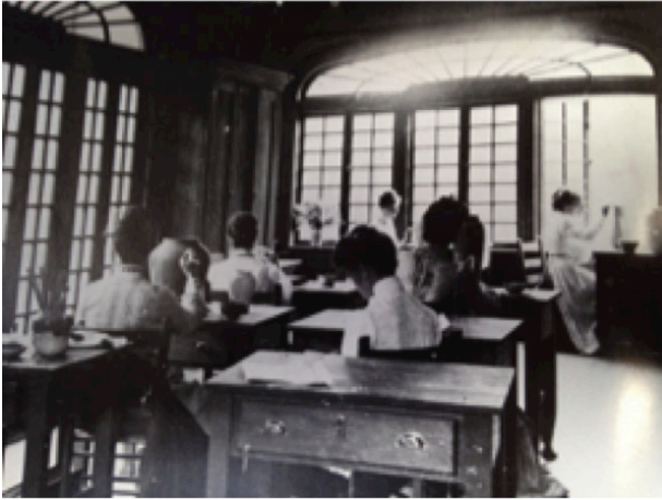
Figure 3 Students decorating pots in the pottery decorating room, ca. 1902-1905