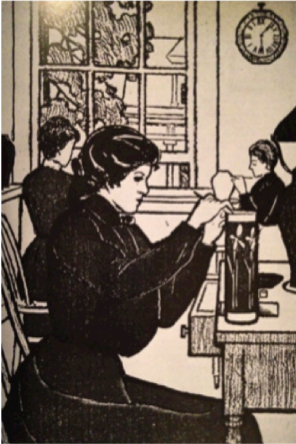
Figure 1 Newcomb pottery decorators depicted at work in a 1902 woodcut, Special Collections, Howard Tilton Library

explanation with his idea of “symbolic intensity...‘charged’ by the reader’s experience outside the work of art” (63) itself. 2 The themes and motifs in the pottery capture the flora and fauna of the Deep South, but they also reveal much to contemporary audiences about women and work at a time when opportunities were severely restricted.